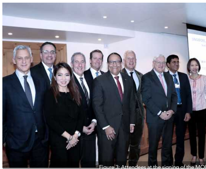
Figure 3: Attendees at the signing of the MOI

IMDA has engaged and brought in new partners to join our effort towards trade digitalisation. The collaboration between IMDA and ICC together with 17 industry partners was formalised through a Memorandum of Intent (MOI) that was signed alongside the World Economic Forum at Davos in January 2020 pushing for the promotion and acceleration of digitally-enabled trade. The global industry leaders participating in the agreement are APRIL, DBS Bank, Marubeni Corporation, Mastercard, Mitsubishi Corporation, Mitsui & Co., Ltd., Mizuho Bank, Ltd., MUFG Bank, Noble, NTT DATA, PSA International, Sampo Japan Nipponkoa, Standard Chartered Bank, Sumitomo Corporation, Sumitomo Mitsui Banking Corporation, Tokio Marine, and Trafigura.