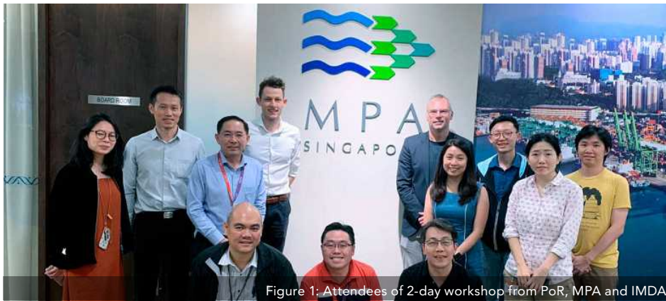
Figure 1: Attendees of 2-day workshop from PoR, MPA and IMDA

In Oct 2019, the Infocomm Media Development Authority of Singapore (IMDA) and the Maritime and Port Authority of Singapore (MPA) co-hosted a two-day workshop for the delegates from the Port of Rotterdam (PoR) to work together on the requirements of title transfer capability in relation to electronic bill of ladings (eBLs) for cross-border trade transactions. The alignment achieved through the workshop provided valuable input in the development of title transfer capability through the TradeTrust software components.